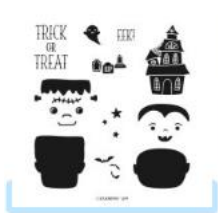
Tricks & Treats Photopolymer Stamp Set (English) [162223] $20.00