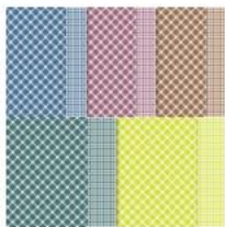
Glorious Gingham 6" X 6" (15.2 X 15.2 Cm) Designer Series Paper [163170] $10.50