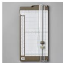
Paper Trimmer [152392] $26.00