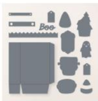
Tricks & Treats Dies [162225] $36.00