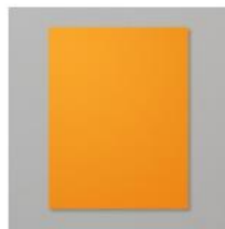
Pumpkin Pie 8-1/2" X 11" Cardstock [105117] $10.00