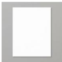
Basic White 8 1/2" X 11" Thick Cardstock [159229] $9.00