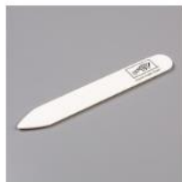
Bone Folder [102300] $7.00