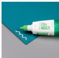
Multipurpose Liquid Glue [110755] $5.50