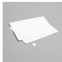
Stampin' Dimensionals [104430] $4.25