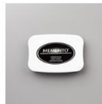
Tuxedo Black Memento Ink Pad [132708] $6.50