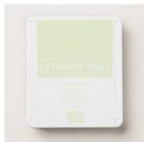
Soft Sea Foam Classic Stampin' Pad [147102] $9.00