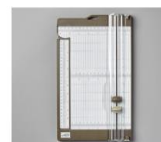
Paper Trimmer [152392] $26.00