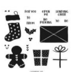
Sending Cheer Photopolymer Stamp Set (English) [162050] $24.00