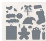
Sending Cheer Dies [162052] $35.00