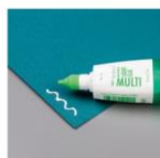
Multipurpose Liquid Glue [110551] $5.50