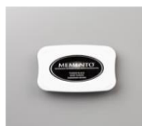
Tuxedo Black Memento Ink Pad [152708] $6.50