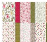
Traditions Of St. Nick 12" X 12" (30.5 X 30.5 Cm) Designer Series Paper [162355] $12.50