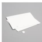
Stampin' Dimensionals [104450] $4.25