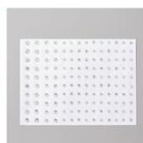
Rhinstone Basic Jewels [144220] $6.00