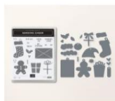
Sending Cheer Bundle (English) [162053] $53.00