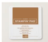
Pecan Pie Classic Stampin' Pad [161665] $9.00