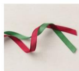
Real Red & Garden Green 3/8" (1 Cm) Ribbon Combo Pack [159577] ---