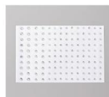
Rhinstone Basic Jewels [144220] $6.00