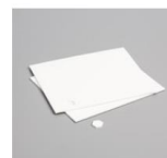
Stampin' Dimensionals [104450] $4.25