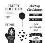
Celebrate With Tags Cling Stamp Set (English) [159974] $23.00