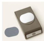
Modern Oval Punch [162234] $22.00