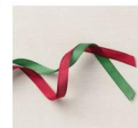
Real Red & Garden Green 3/8" (1 Cm) Ribbon Combo Pack [159577] $7.50