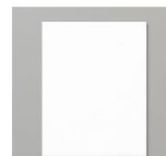
Basic White 8 1/2" X 11" Thick Cardstock [159229] $9.00