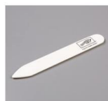
Bone Folder [102500] $7.00