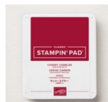
Cherry Cobbler Classic Stampin' Pad [147083] $9.00