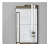
Paper Trimmer [152392] $26.00