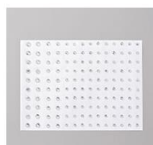
Rhinstone Basic Jewels [144220] $6.00