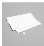
Stampin' Dimensionals [104430] $4.25