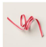
Sweet Sorbet 1/4" (6.4 Mm) Bordered Ribbon [162558] $8.00