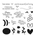
Bee My Valentine Photopolymer Stamp Set (English) [162547] $21.00