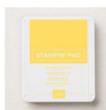
Daffodil Delight Classic Stampin' Pad [147094] $9.00