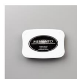
Tuxedo Black Memento Ink Pad [152708] $6.50