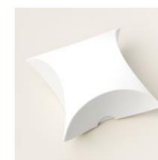
Square Pillow Boxes [162559] $8.00