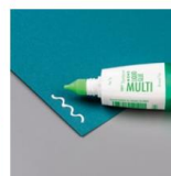
Multipurpose Liquid Glue [110755] $5.50