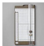
Paper Trimmer [152392] $26.00