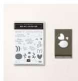
Bee My Valentine Bundle (English) [162554] $38.50