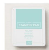
Pool Party Classic Stampin' Pad [147107] $9.00