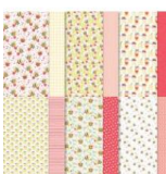
Bee Mine 12" X 12" (30.5 X 30.5 Cm) Designer Series Paper [162546] $21.00