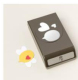
Bee Builder Punch [162553] $22.00