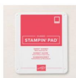
Sweet Sorbet Classic Stampin' Pad [159216] $9.00