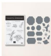
Thoughtful Expressions Bundle (English) [162822] $55.75