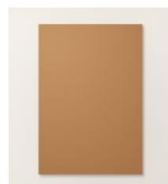
Pecan Pie 8 1/2" X 11" Cardstock [161717] $10.00