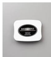
Tuxedo Black Memento Ink Pad [152708] $6.50