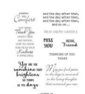
Hope You Know Cling Stamp Set (English) [161409] $24.00