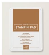
Pecan Pie Classic Stampin' Pad [161665] $9.00