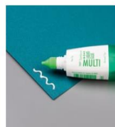
Multipurpose Liquid Glue [110755] $5.50