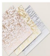
Naturally Gilded 12" X 12" (30.5 X 30.5 Cm) Specialty Designer Series Paper [161659] $10.00