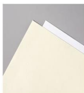
Very Vanilla 8-1/2" X 11" Thick Cardstock [144237] $9.00