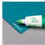
Multipurpose Liquid Glue [110755] $5.50