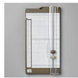
Paper Trimmer [152392] $26.00