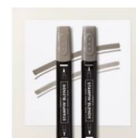
Pebbled Path Stampin' Blends Combo Pack [161658] $10.00