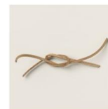
Gold 1/8" (3.2 Mm) Faux Leather Trim [162644] $9.00