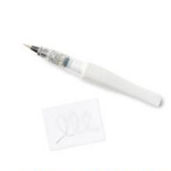
Clear Wink Of Stella Glitter Brush [141897] $8.00