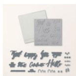
Thoughtful Moments Hybrid Embossing Folder (English) [162927] $38.00