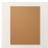
Pecan Pie 8 1/2" X 11" Cardstock [161717] $10.00