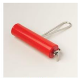
Stampin' Brayer [162936] $16.00