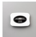
Tuxedo Black Memento Ink Pad [132708] $6.50