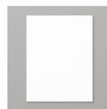
Basic White 8 1/2" X 11" Cardstock [159276] $10.50