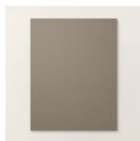
Pebbled Path 8 1/2" X 11" Cardstock [161722] $10.00