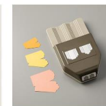
Lovely Labels Pick A Punch [152883] $24.00