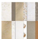
Nature's Sweetness 12" X 12" (30.5 X 30.5 Cm) Specialty Designer Series Paper [162616] $16.50