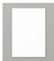
Basic White 8 1/2" X 11" Cardstock [159276] $10.50