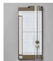
Paper Trimmer [152392] $26.00