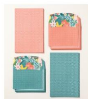
Sweet Thoughts Memories & More Cards & Envelopes [162931] $10.00