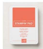
Calypso Coral Classic Stampin' Pad [147101] $9.00