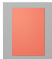
Calypso Coral 8-1/2" X 11" Cardstock [122925] $10.00