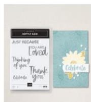
Softly Said Cling Stamp Set (English) [162906] $25.00