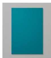
Pretty Peacock 8-1/2" X 11" Cardstock [150880] $10.00