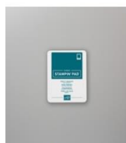
Pretty Peacock Classic Stampin' Pad [150083] $9.00