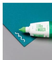
Multipurpose Liquid Glue [110755] $5.50