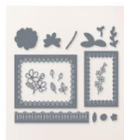
Darling Details Dies [161370] $36.00