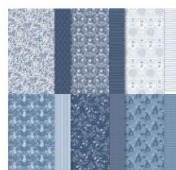
Countryside Inn 12" X 12" (30.5 X 30.5 Cm) Designer Series Paper [161467] $12.50