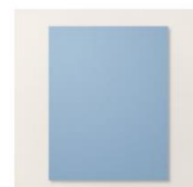
Boho Blue 8 1/2" X 11" Cardstock [161724] $10.00