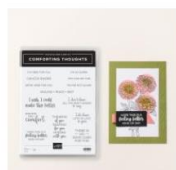
Comforting Thoughts Photopolymer Stamp Set (English) [163691] $20.00