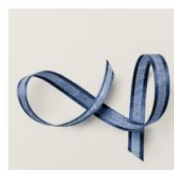
Night Of Navy 5/8" (1 Cm) Bordered Ribbon [160581]