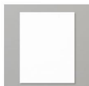
Basic White 8 1/2" X 11" Cardstock [159276]