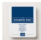
Night Of Navy Classic Stampin' Pad [147110] $9.00