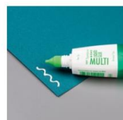
Multipurpose Liquid Glue [110755] $5.50