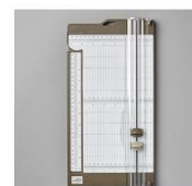
Paper Trimmer [152392] $26.00