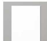
Basic White 8 1/2" X 11" Cardstock [159276]