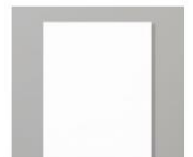
Basic White 8 1/2" X 11" Thick Cardstock [159229]