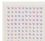
Iridescent Faceted Gems [163568]