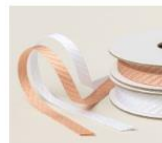
Petal Pink & White 1/4" (6.4 Mm) Diagonal Trim Combo Pack [163417]