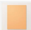
Peach Pie 8 1/2" X 11" Cardstock [163799] $11.50