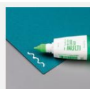
Multipurpose Liquid Glue [110755] $6.00