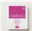
Berry Burst Classic Stampin' Pad [147143] $9.00