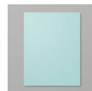
Pool Party 8-1/2" X 11" Cardstock [122924] $11.50