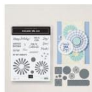
Round We Go Bundle (English) [163730] $45.00