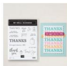
My Small Business Photopolymer Stamp Set (English) [163720] $19.00