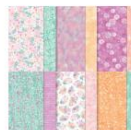
Unbounded Beauty 12" X 12" (30.5 X 30.5 Cm) Designer Series Paper [163372] $12.50