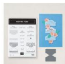
Keeping Tabs Dies Bundle (English) [163343] $27.75